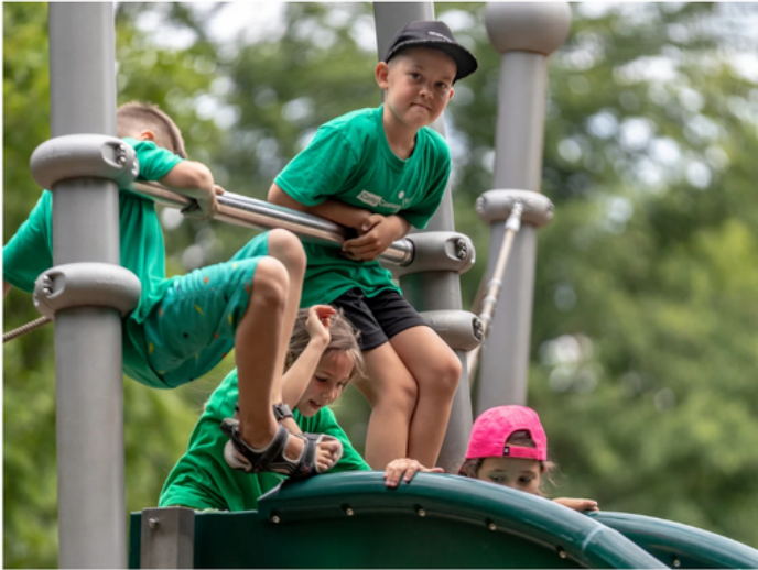
Camp Cosmos kids line up on the slide in Westmount Park July 21, 2022.

Monique Polak • Special to The Montreal Gazette Jul 31, 2022 • August 1, 2022 • 4 minute read • Join the conversation